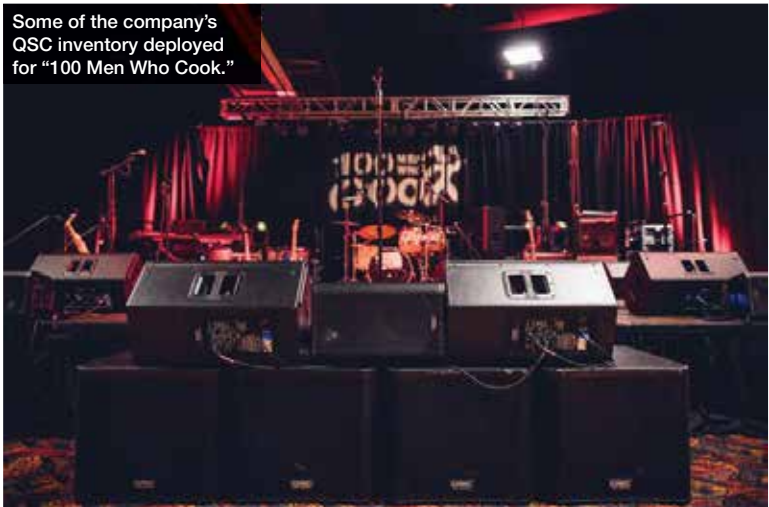
Some of the company's QSC inventory deployed for "100 Men Who Cook."

The interpersonal skills she brings to the table from this service has been